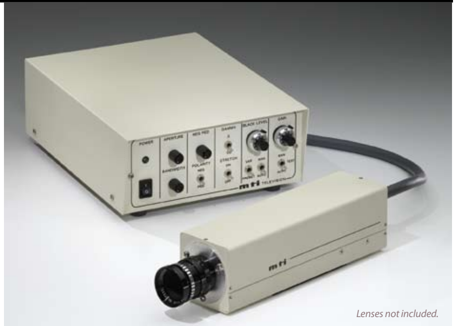
Lenses not included.

The LSC-70 series real-time video camera is ideal for applications requiring infrared sensitivity up to 2200nm. Designed for quantitative analysis, the front panel controls offer precise automatic or manual operation. Maximum contrast and optimum image sharpness is obtained through the extended gain and black level offset ranges and aperture and bandwidth controls.