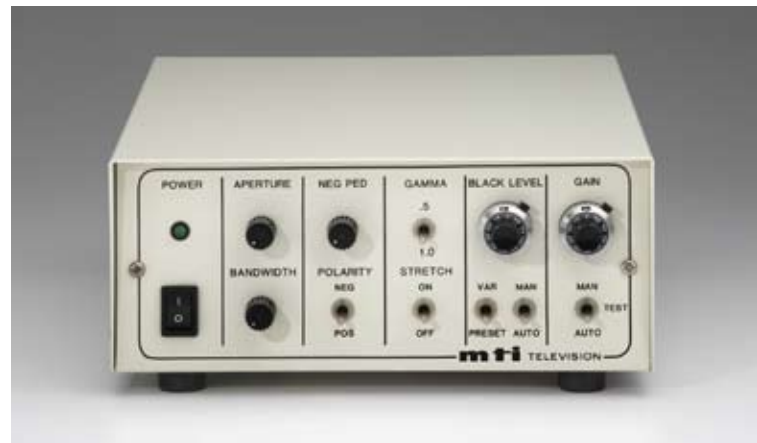
Above (left) Dage-MTI LSC 70 camera head, and (right) control panel. Lens not included.