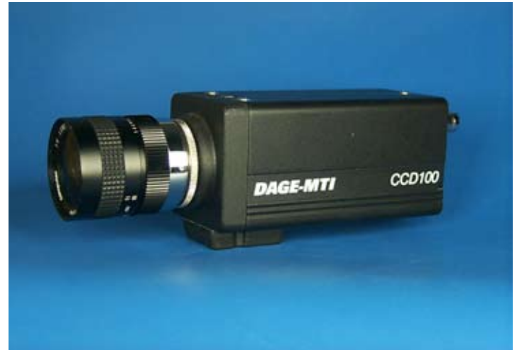
Above: Dage-MTI CCD100. Lens not included.

The CCD-100 series cameras are designed to give high-end black and white images at an affordable price. The cameras' automatic controls provide exceptional performance from high light level to low light level images. Adjustable back panel controls include gain, black level, enhance, polarity reversal, gamma, and shutter. An optional remote control conveniently brings back panel controls to desk-top level. The CCD-100S can be integrated for approximately 3 seconds, while additional sensitivity can be obtained with the spot-mask circuit in the CCD-100.